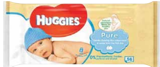
Huggies Baby Wipes Pure