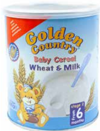
Golden Country Baby Cereal