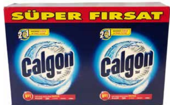
Calgon Washing Powder