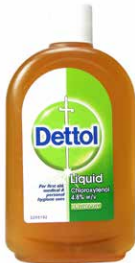
Dettol Antiseptic Liquid