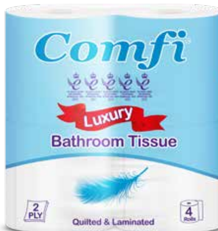
Comfi Luxury T/Roll 4 Roll- White