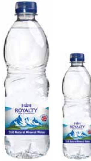
Royalty Still Natural Mineral Water