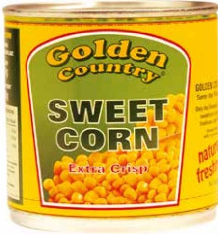
Golden Country Extra Crisp Sweetcorn