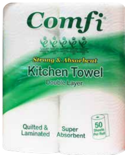
Comfi Strong Kitchen Towel