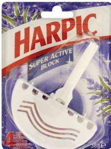
Harpic Super Active Rim Block Lavender/ Pine/ Citrus