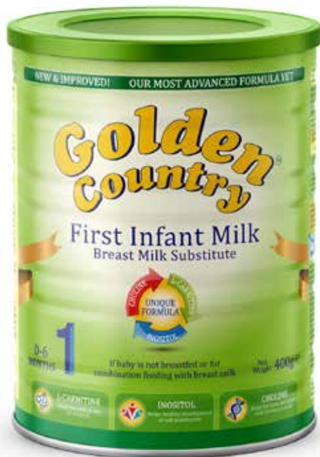
Golden Country Infant Milk Stage 1 24x400g

PLEASE CONTACT YOUR ACCOUNT MANAGER FOR GREAT OFFERS!