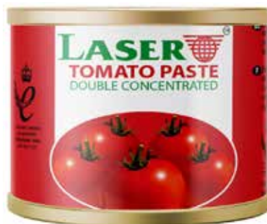
Laser Tomato Paste