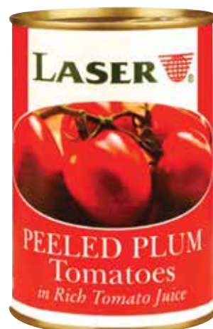
Laser Peeled Plum Tomatoes