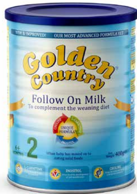
Golden Country Follow on Milk Stage 2 24x400g