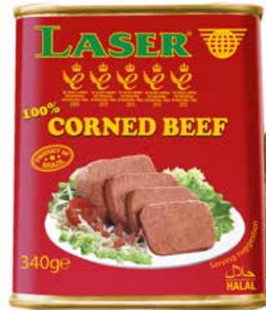
Laser Corned Beef