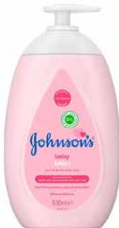
Johnson's Baby Lotion