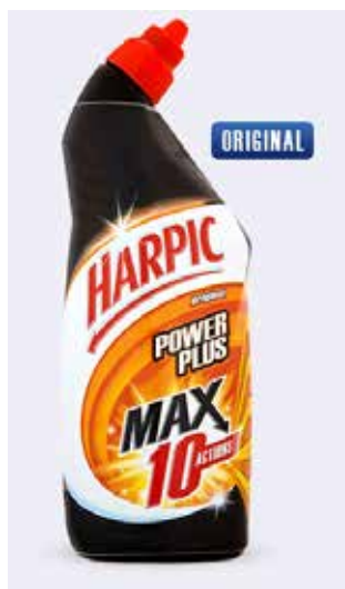
Harpic Power Plus Original