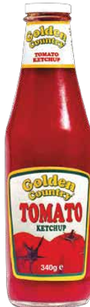
Golden Country Tomato Ketchup