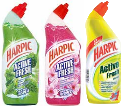
Harpic Active Cleaning Gel Pine/ Citrus/ Blossom