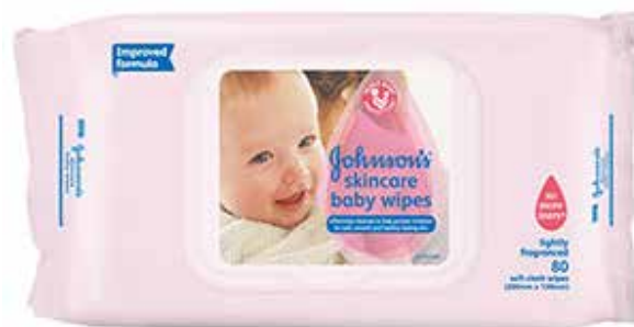
Johnson's Baby Wipes Refills